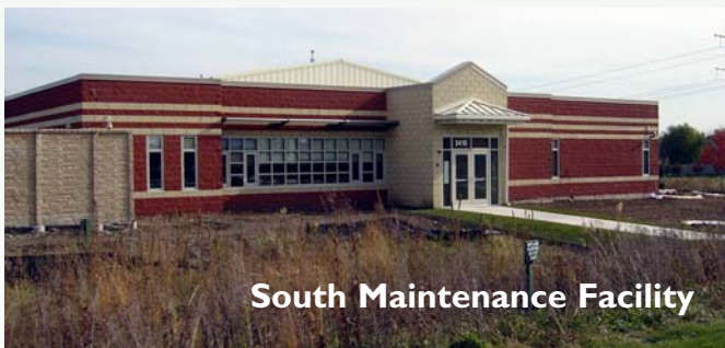
South Maintenance Facility

The South Maintenance Facility at Frontier Park was one of the larger projects underway in 2006. With construction scheduled to be completed by summer 2007 and an estimated cost of about $4.5 million, the new facility will provide office space, maintenance garages, material bins, and a cold storage building. Most of all, having a dedicated parks maintenance facility in south Naperville will reduce the labor and material costs to maintain the parks and facilities in that area.