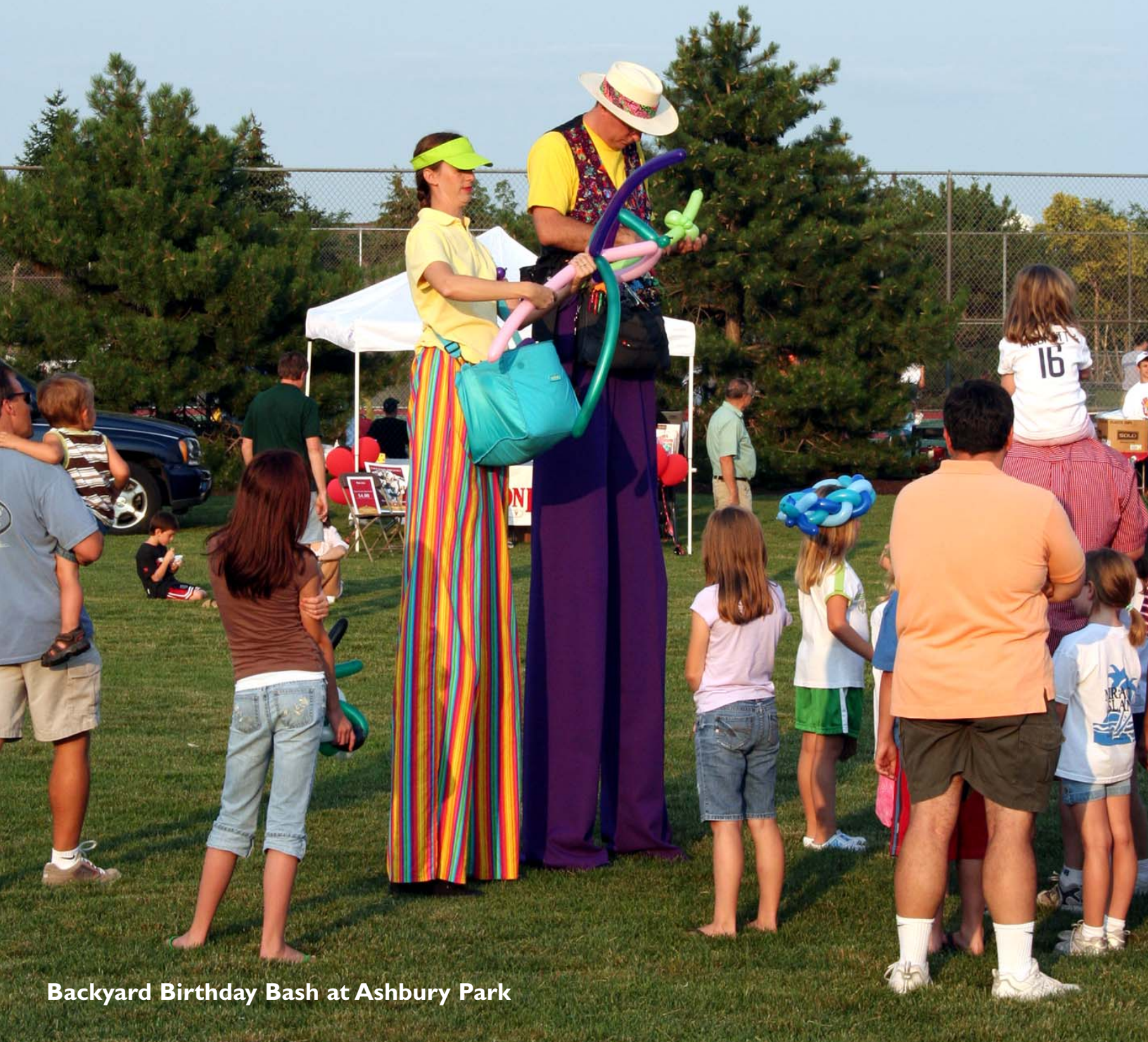
Backyard Birthday Bash at Ashbury Park